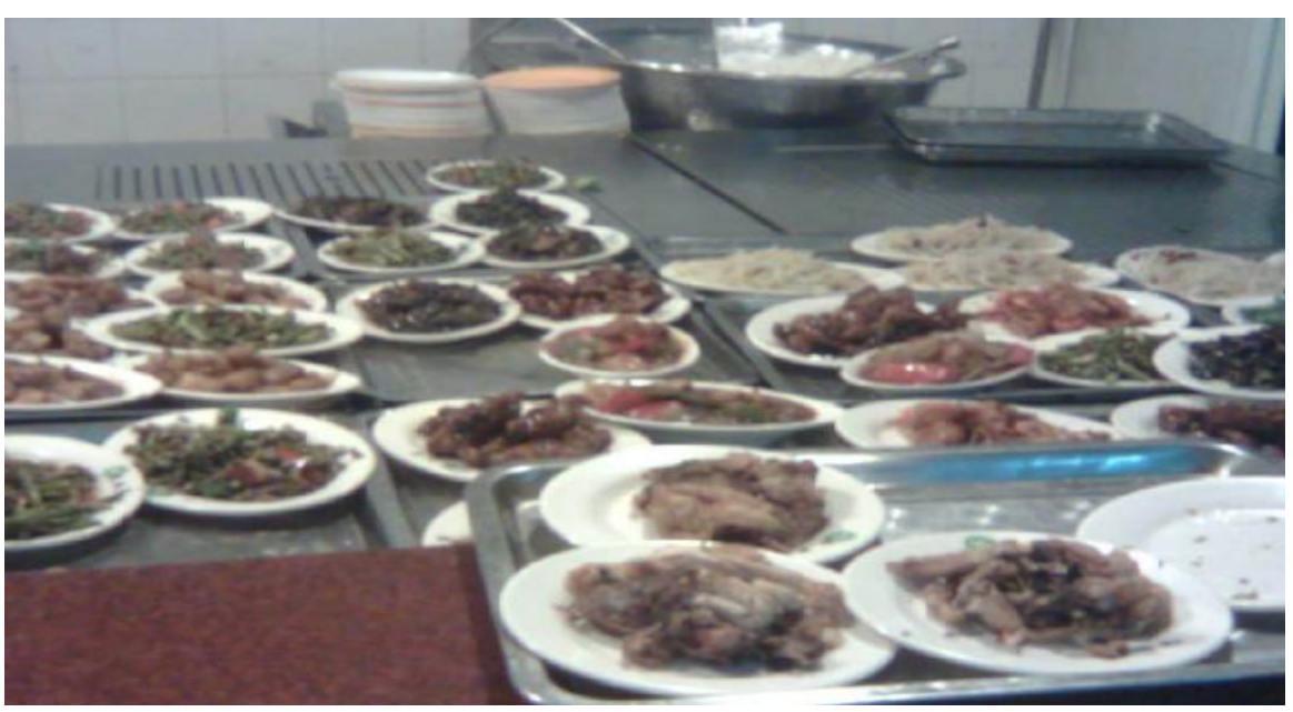
Some single dishes. More delicious but cost more

In China, we like stir-fry food, with much oil. In some areas capsicum is common seen in every dish, it make the meal look colorful and taste better. But it is only in the west part of China. In the east China, especially those cities near the see, people like to put sugar when they are cooking. So in university many students come from the west, find it hard to adapt themselves to the canteens east-style food.