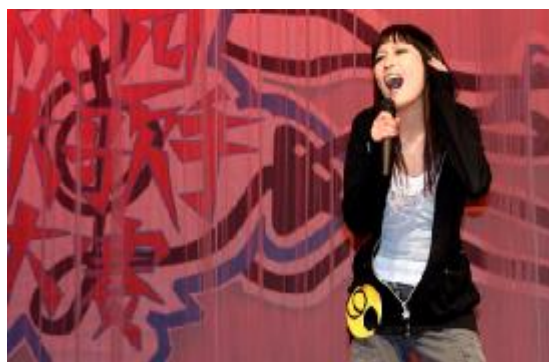
We are saluting Olypmic Game Torch Relay