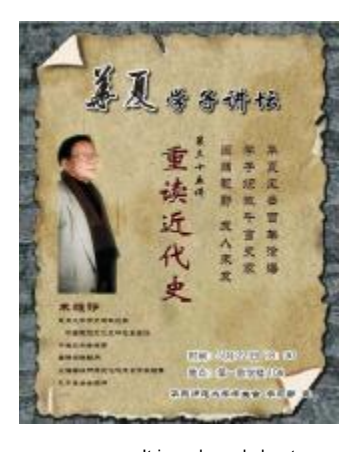
It is a placard about Chinese modern history lecture