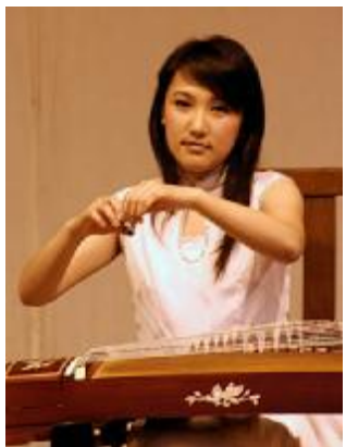
At the Arts Festival competition (1) At the Arts Festival competition (2)