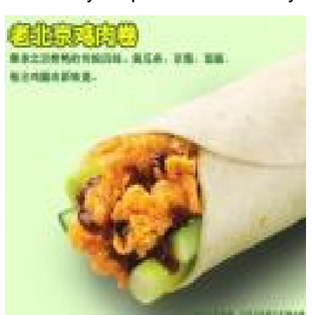
Old BeiJing chicken roll

There is a strange phenomenon in China that some fast food foreigners consider unhealthy is quite welcomed by Chinese people.